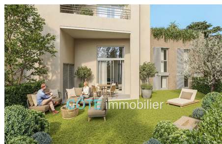
Programme neuf - Convention milancip - MLS Côte d'Azur