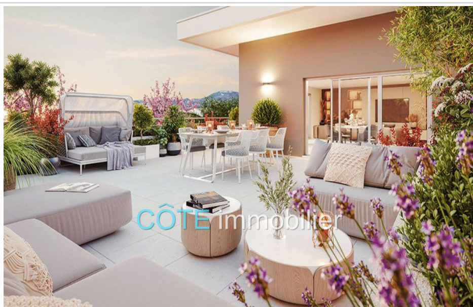
Programme neuf - Convention milancip - MLS Côte d'Azur