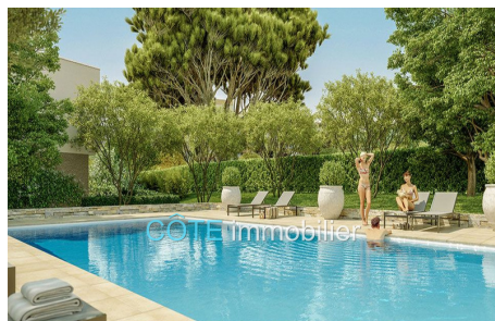
Programme neuf - Convention milancip - MLS Côte d'Azur