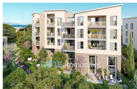
Programme neuf - Convention milancip - MLS Côte d'Azur