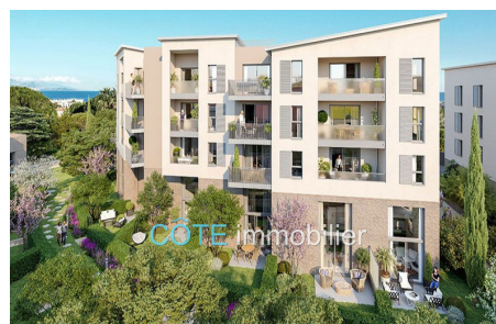
Programme neuf - Convention milancip - MLS Côte d'Azur